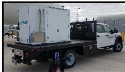
G6W – On Truck