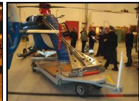
G3D (Duct Configuration)