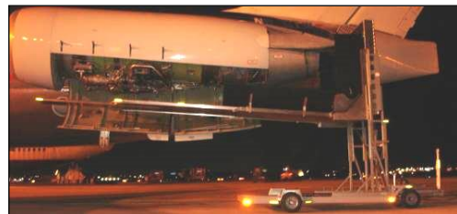
G3C lifted under Engine