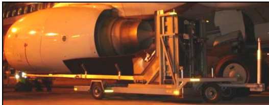
G3C under Engine